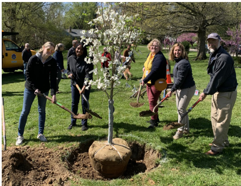
TreeVitalize celebrated the 150th anniversary of Arbor Day in 2022 with the State Forester.

Tree Tenders® is a training program that educates citizens about tree biology, tree planting, tree maintenance, and a suite of urban forestry practices. Volunteers help build capacity among local government to understand, protect, and restore their community trees. By conducting tasks such as mulching, watering, pruning, and data collection and entry, volunteers help stretch communities resources. Instruction is provided by DCNR's Bureau of Forestry, in partnership with Penn State Extension, Pennsylvania Horticulture Society, The Western Pennsylvania Conservancy, and other local urban forestry experts.