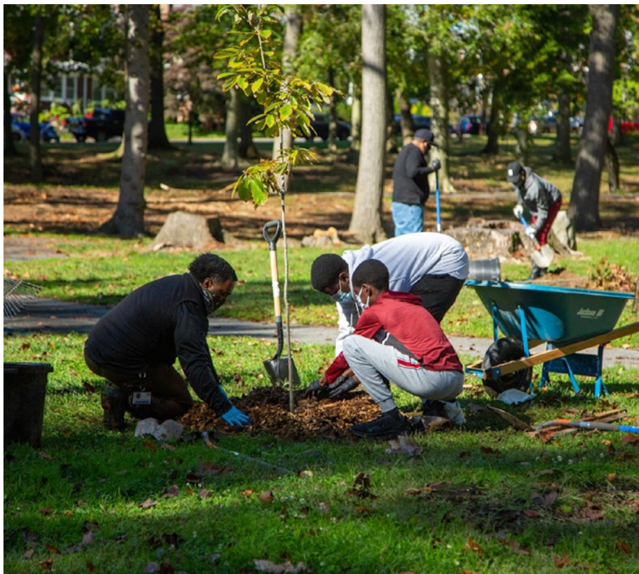
Volunteer tree planting in Haynes Park Wilmington Delaware.

Spread over four sessions, the curriculum is complete once a tree steward has finished the sessions and participated in a Delaware Forest Service or partner planting event. Topics covered include: how trees work, tree planting, care, and procurement. Organization, advocacy, and fundraising are also covered. By completing training and networking with other stewards, graduates will recognize opportunities and coordinate tree projects where they are needed most.